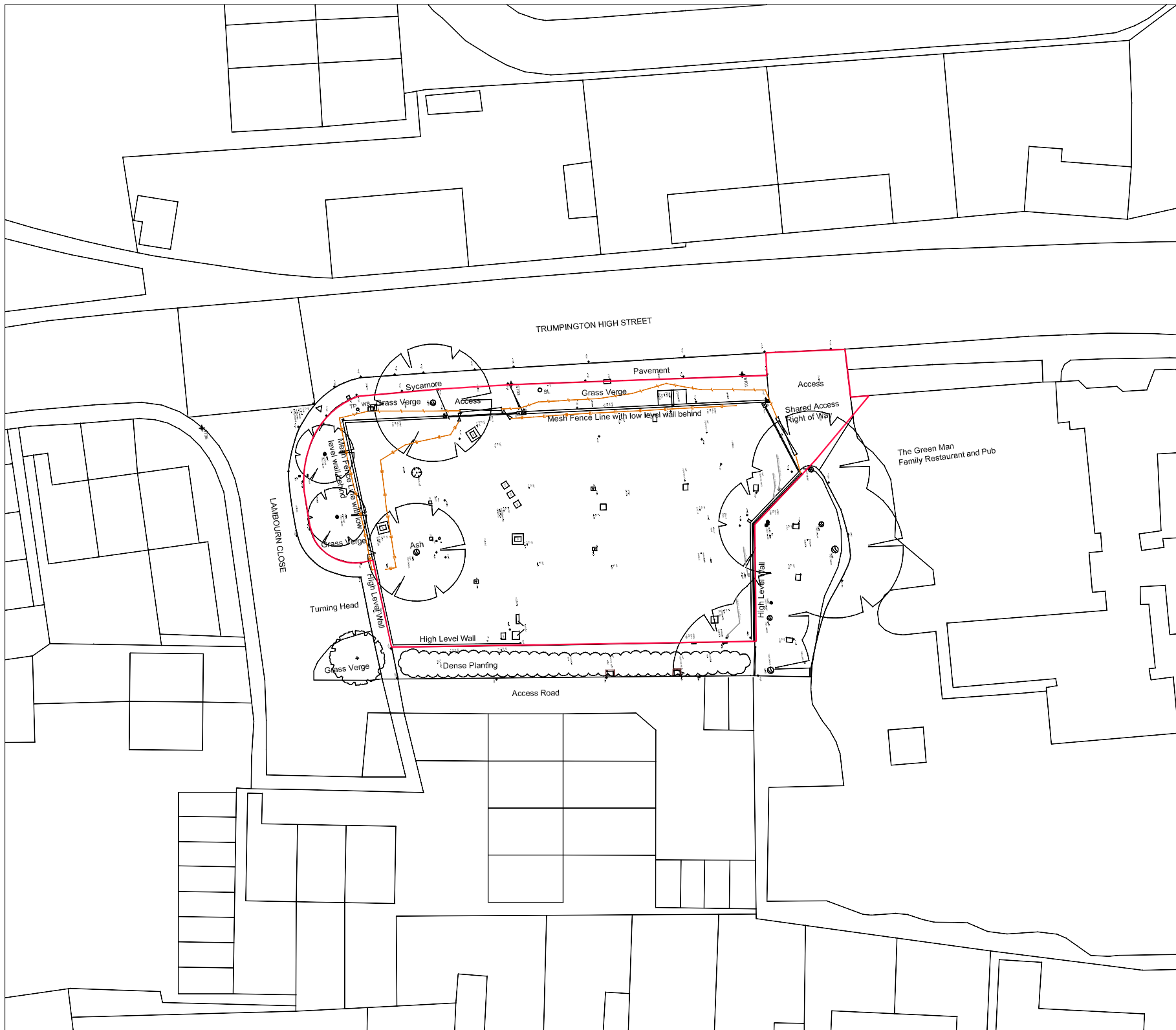
SITE BLOCK PLAN - 1:500